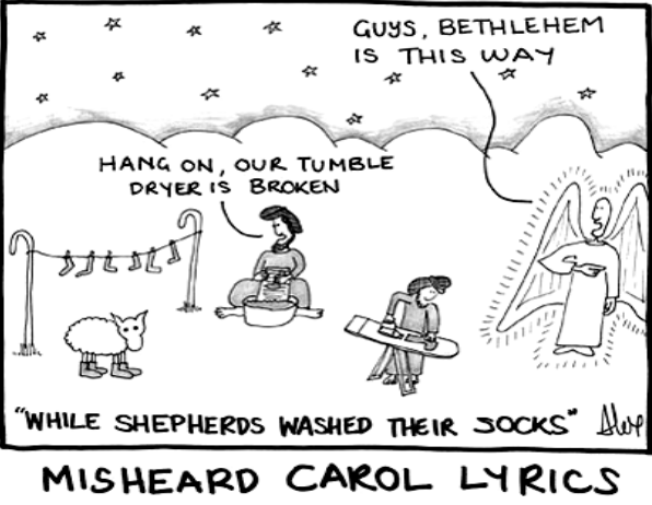
MISHEARD CAROL LYRICS